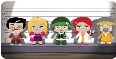
Figure 2: “Alibi” suspects lining up for questioning.

Besides proposing working with Alice, the 2013 edition added a “gamified” alternative: students could participate in “Alibi”, a murder story based on Chatbot. Five funny suspects, a corpse and a detective are left alone in a mountain. The detective keeps a log book with his findings and speculations, which is weekly made available to participants along with an interrogation questionnaire from the detective for each suspect. Participants download the file and are supposed to program their Chatbot so that it answers the questions properly (a structured task). Chatbot confesses guilt if it cannot find a matching rule, and flags an answer as incorrect if there is a rule but the output does not match the (encrypted) regular expression that the questionnaire file has for identifying correct answers. Students must keep their bot from confessing but also from flagging answers as incorrect. Based on how well the bot answers a score is calculated. It reaches 100% if all questions are answered properly. A jury of experts then picks winners among the top ranked bots, which must be programmed using concepts such as variables and finite state automata. As in the case of Alice students are supposed to learn by watching the five online Chatbot tutorial videos and using the support fora.